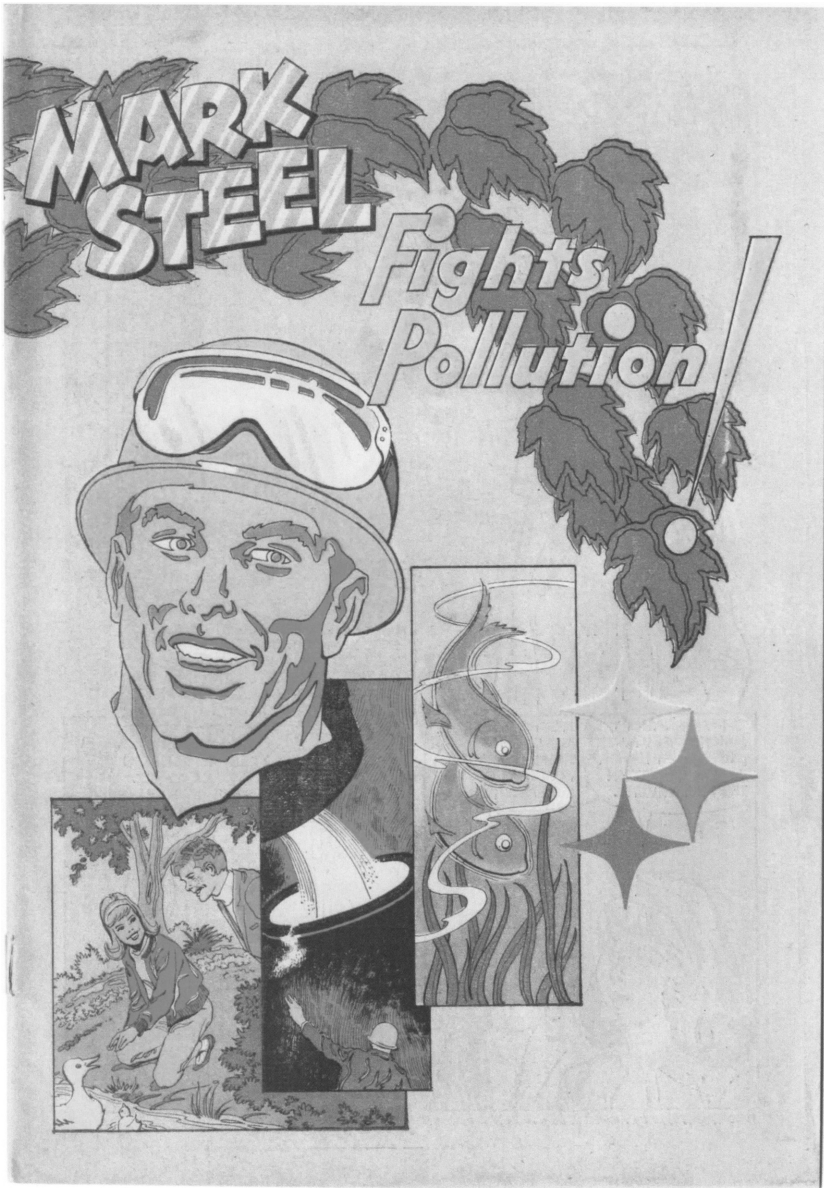
Mark Steel—the pollution fighting (not causing) comic book hero.

Thus, even in cases where our best writing skills are put to use in litigation, we still encounter primary sources that do not fit into our narrowly constructed legal inquiry but which would allow the development of a relevant and dynamic story that is highly relevant to larger historiographical questions.